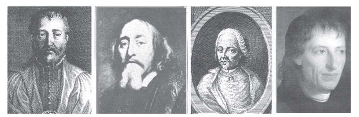
Fig. 2 From left: Hájek Tadeáš (from Hájků, 1526–1600), Komenský Jan Amos (Comenius, 1592–1670), Prokop Diviš (1696–1765) and Bolzano Bernard (1781–1848)